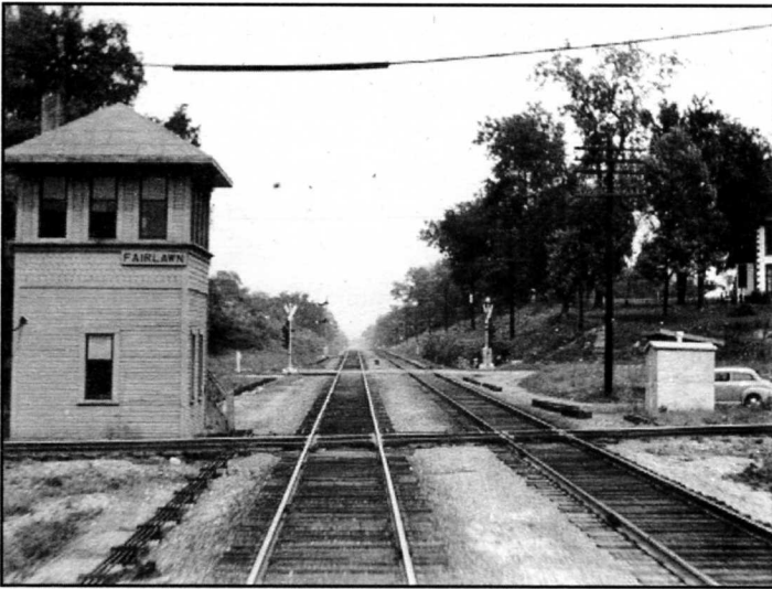
The former Fairlawn tower guards the Frisco's crossing with MoPac's Carondolet Branch, which passes diagonally across the photo, in this February 1937 view looking eastward.

From the Collections of the St. Louis Mercantile Library at the University of Missouri-St. Louis